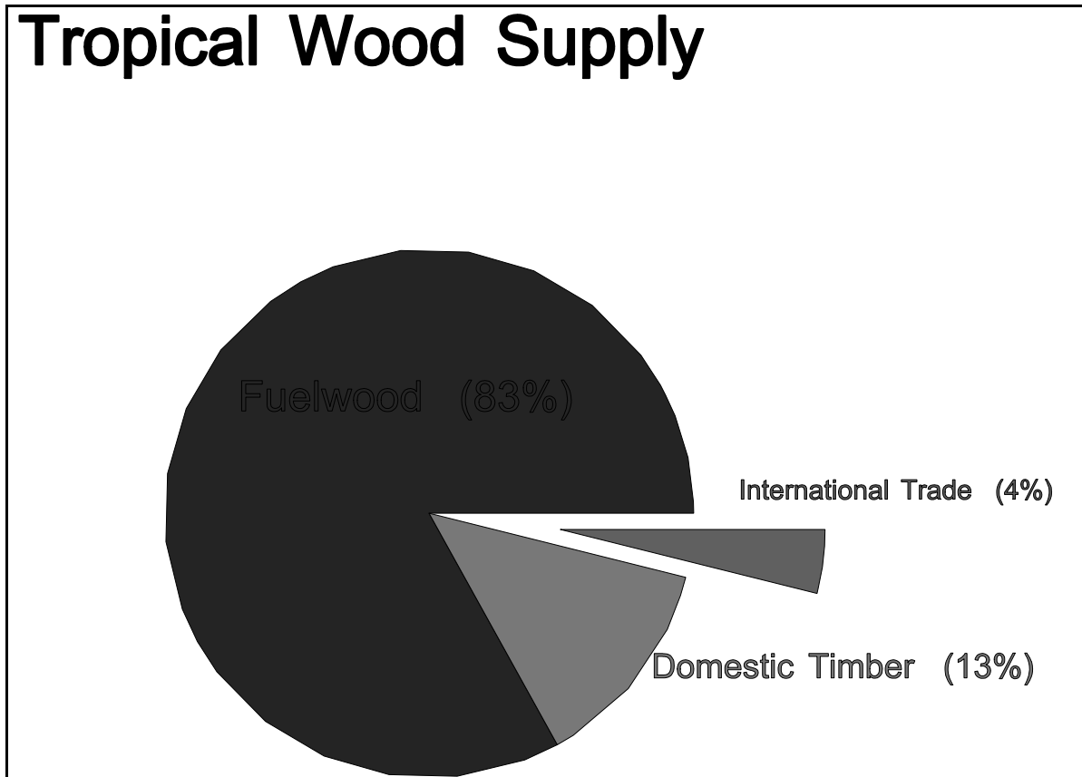
Figure 1. Consumption of tropical wood 2 .

overuse through the gathering of fuelwood and fodder, from grazing, and from the resulting soil erosion. This is not just an ecological disaster, but a human tragedy. Many people suffer malnutrition not only because of food shortages, but also because