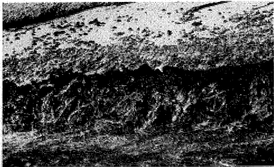
FIG. 2 - Gently sloping rocks on the east coast showing the lower regions of the barnacle zone, the coralline zone, the dark band of Xiphophora chondrophylla and the upper portion of the sub-littoral fringe.