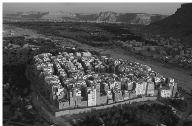
Figure 1. Tower houses of Shibam, Yemen (1600AD)

Social, economic and technological developments in the latter parts of the 19 th century created the environment for modern high-rise buildings to emerge in North American cities of New York and Chicago. Perhaps the two most important technological factors contributing to emergence of modern tall buildings were advancements in steel structures and vertical transportation (ie, lifts). Gustav Eiffel used pre-assembled iron components to design and construct his 300m+ tall tower in Paris in 1889 thereby doubling the height of the previously tallest man-made structure in the world (ie, Washington Monument, USA) and showcasing the viability of tall metal structures. In 1852, Elisha Graves Otis built the first fall-safe hoisting system, the “elevator”, which made the case for tall buildings much more feasible.