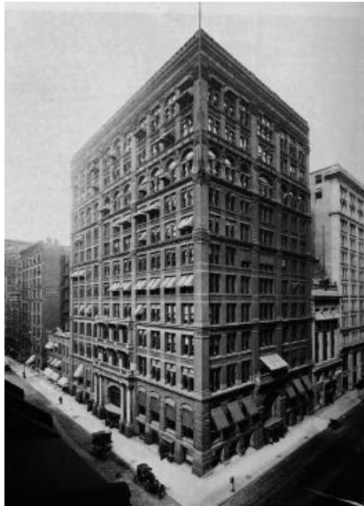
Figure 2. Home Insurance Building, Chicago (1885)

The Home Insurance Building in Chicago is considered as the first steel framed gravity system used in high-rise construction (Figure 2). The replacement of thick masonry bearing walls -the common gravity resisting system up to that time- with steel columns allowed large windows and entries to be introduced on the perimeter of the building transforming the architecture and functional flexibility of common high-rise buildings.