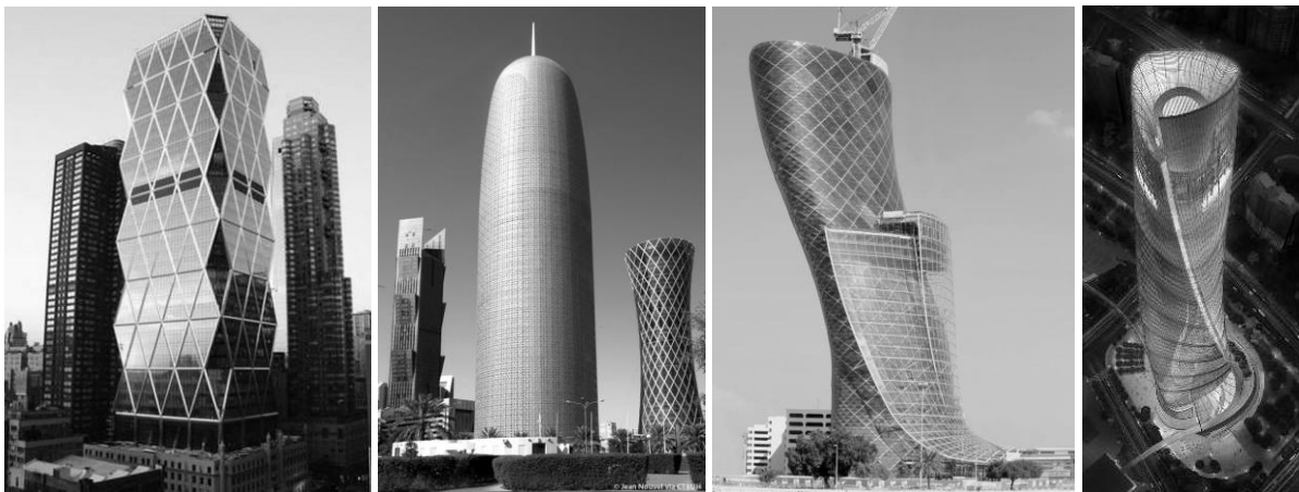
Figure 4. (a) Hearst Tower, New York; (b) Doha Tower, Qatar; (c) Capital Gate, UAE; (d) Shanghai Centre, China