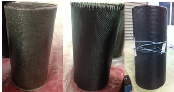
Figure 1. Sample preparation

and thus allow for the resin to dry and reach full strength One day prior to testing excess fibre reinforcement was trimmed. Two strain gauges were then applied vertically and equidistantly around the marked midpoint. Samples thus prepared are shown in Figure 1.