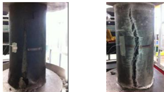
Figure 2. Tested samples

The fibre wrapped specimens were then tested in a Sans compression testing machine with 1500 kN loading capacity at a constant cross head speed of 2 mm/min. Axial strains were measured using platen to platen method and two longitudinal strain gauges glued diagonally opposite in the middle third of the specimen height. A commercially available data logging system named “System 5000” was used as the data acquisition system, which required a host computer for entering commands, reading the returned data and for managing the output channels. Compression testing was performed as per AS1012.9 (Australia, 1999). Samples failed in compression are shown in Figure 2.