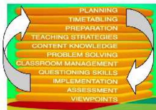
Figure 2. Pedagogical knowledge practices for mentoring

This research draws upon a conceptual framework around one of the five factors (i.e., pedagogical knowledge practices), as outlined in the journal Teachers and Teaching: Theory and Practice (Hudson, 2013). In brief, the framework focuses on 11 pedagogical knowledge practices elicited from the research literature around mentoring and teaching (Figure 2). The practices are interrelated theoretically and statistically (see Hudson, Skamp, & Brooks, 2005) and provide a conceptual framework for mentors to access and as a framework for collecting data on mentoring pedagogical knowledge practices. Differentiation of student learning needs connects each of the pedagogical knowledge practices. For instance, mentoring for planning to teach effectively requires the mentee to consider the various needs of students in the classroom.